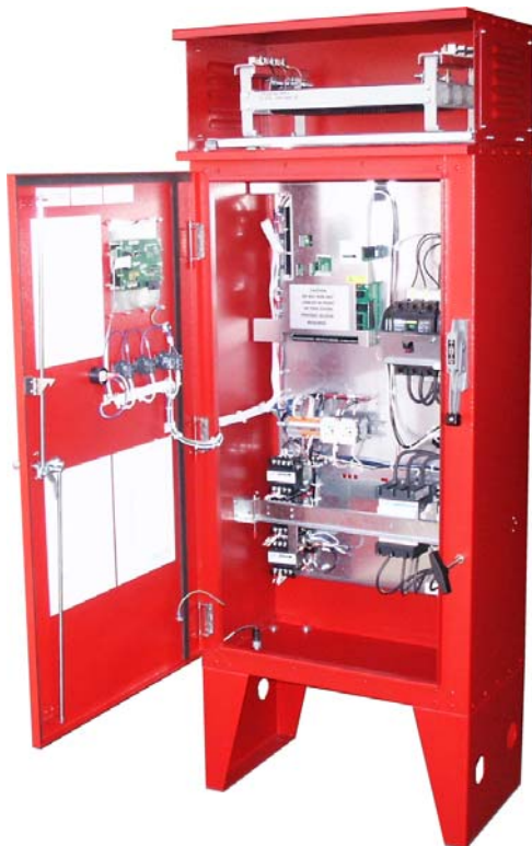
MP400 Fire Pump Controller

The controller is completely wired, assembled, and tested at the factory before shipment, and ready for immediate installation.